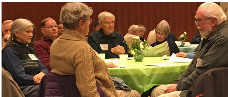
Friends Enjoy Good Food & Each Other at the Annual Meeting