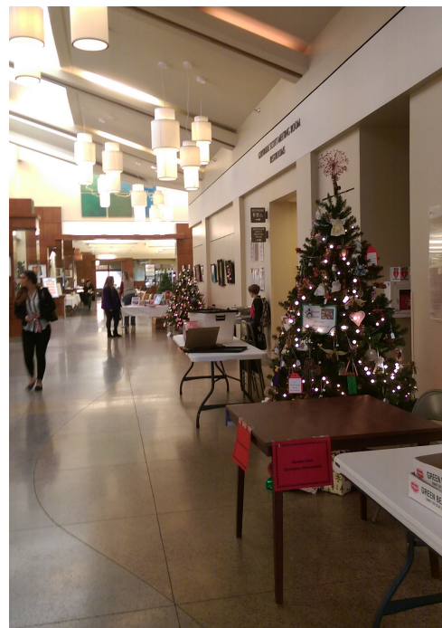
Library Halls Decked with Loveland Lights